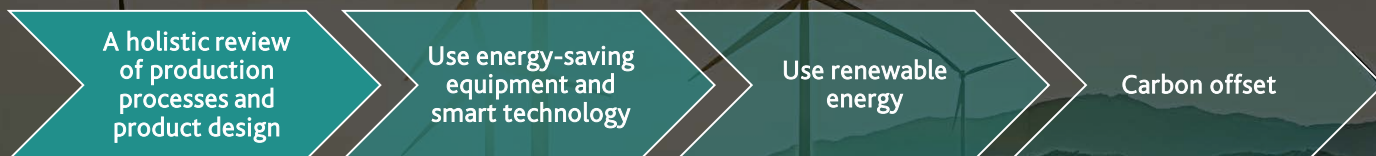
Figure 1. First steps towards decarbonisation

To achieve the global goal of net zero by 2050, companies are advised to speed up their process of decarbonising their business operations and models to become climate-change resilient while minimising the impact of potential policy changes and emissions-related costs. The decarbonisation journey might not be the same for every company, because different industries have different development and production processes. In general, however, companies may consider the following steps to start with: